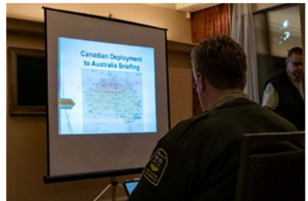
CIFFC Members at a briefing for a deployment to Australia in 2019.

CIFFC, a not-for-profit corporation owned and operated by federal, provincial and territorial wildland fire management agencies, coordinates requests for assistance and provides operational forest fire management services to its member agencies. Members are made up of the provincial, territorial and federal (Parks Canada and the Canadian Forest Service) agencies responsible for wildfire management in Canada. Through Mutual Aid Resource Sharing Agreements, additional national and international resources are available as needed to ensure the BC Wildfire Service and other wildfire management organizations in Canada have the capacity to manage their respective wildfire situations. CIFFC and its members have arrangements with the United States, Australia, Mexico, New Zealand and South Africa to receive or provide wildfire support.