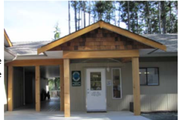
Coastal Fire Centre, Parksville, BC

The Coastal Fire Centre is an area with 85% of BC's population and has a large body of water bisecting it. This means that bases with access to transportation hubs, that are strategically spaced, and not hampered or delayed by waterways, is essential.