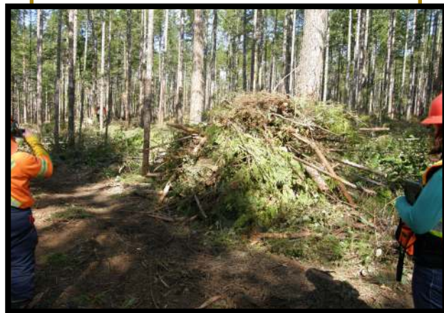
qathat Regional District in the Powell River area undertaking a fuel mitigation project at Penticton Trails.

To obtain copies of the FireSmart Homeowner’s Manual to share with your community go to: https://firesmartbc.ca/resource-ordering-form/ .